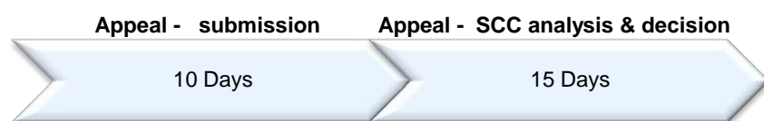
Table 1: Duplication Resolution Mechanism (DRM) Process Steps and Timelines

Appeals – Completion of the Appeal Request Report (ARR) (following SCC analysis & decision)